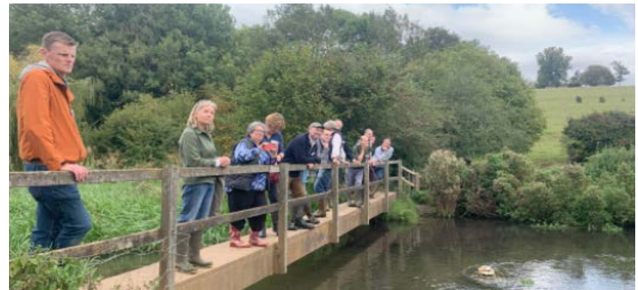
River Chess, Herts, Sept 23