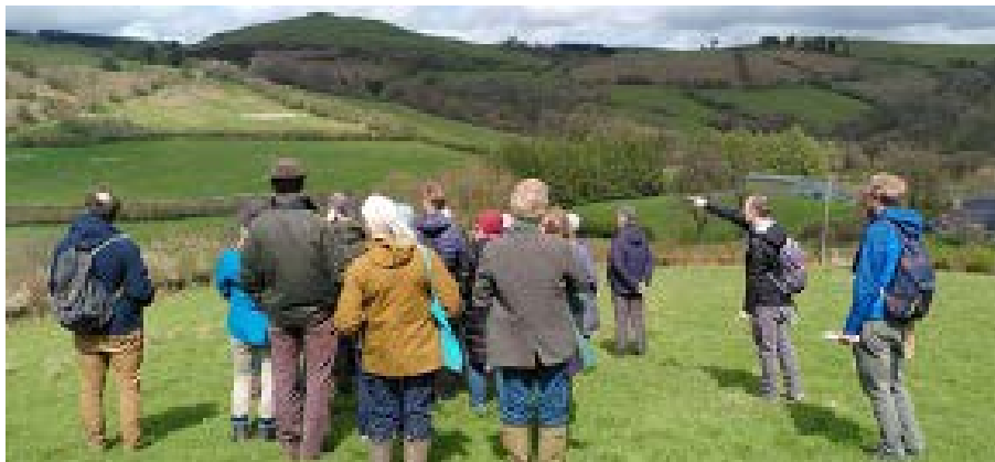
Pentwyn, Wales, April 23

In November, we hosted an event in Manchester to support and inspire funders in that part of the country. Held at the Manchester Art Gallery alongside their exhibition on climate justice, the event was about the links between a thriving environment, healthy people and resilient communities.